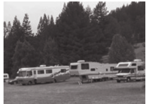
RV's and Tent Campers Welcome

Accommodations: You could make a vacation around this event. Self-contained RVs and tent campers are welcome to set up from 6/20 - 6/28. Campfires only in designated areas. There are no 120v hookups but there are chemical toilets in the meadow. Restrooms at the degree site have a hot water shower in the men's, available to women. Motels and rental RV's are available at the coast, 30 minutes on a dark and winding road from the RAM site. Call as soon as possible for your reservations, it's a popular tourist area.