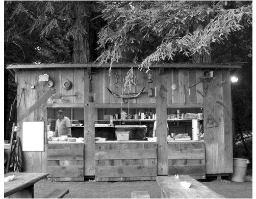
Comptche Cook Shack

TRADEWINDS LODGE (707) 964-4761 SURREY SUPER 8 (800) 206-9833 HARBOR LITE LODGE (707) 964-0221 RESERVE EARLY!!