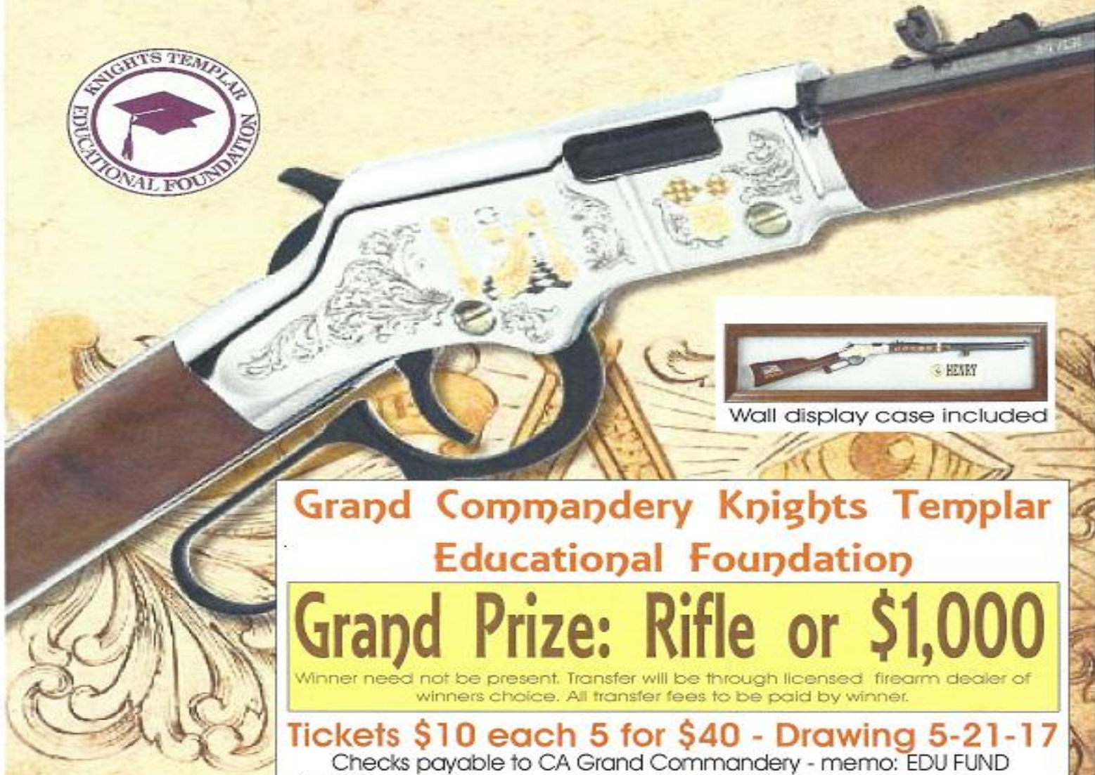
Wall display case included

Grand Commandery Knights Templar Educational Foundation