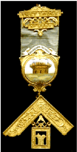
Past Master's jewel

An example of a Past Master's Jewel featuring the 47th Problem of Euclid from England. Past Master's jewel used in the USA often do not show the 47th Problem anymore.